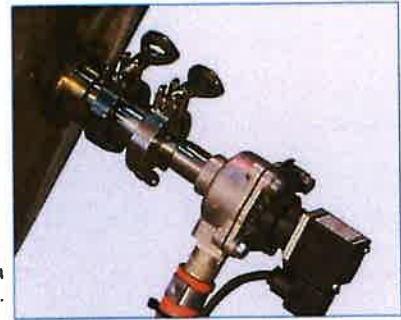
3/4" VA-06-TRI-TRI shown with solenoid valve.

To clean the blenders between batches, they used a flushing routine which involved manually loading flour into the blenders, running the equipment for a set amount of time, and then emptying the equipment of all the flour and stray ingredients.